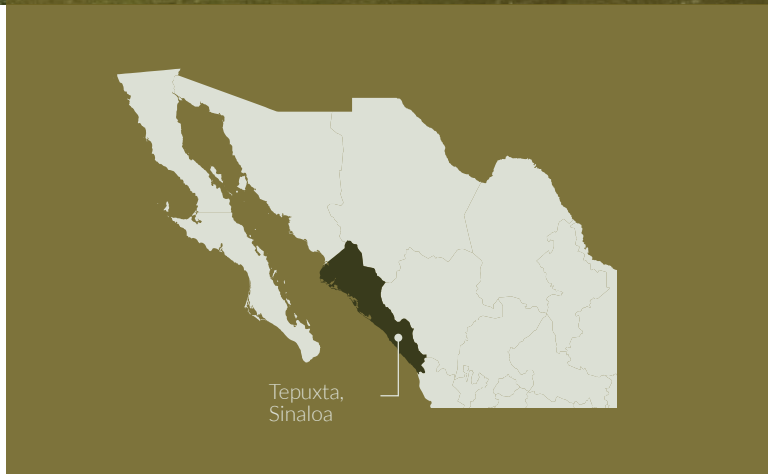
Map: Intervention area of the Monte Mojino Fund.