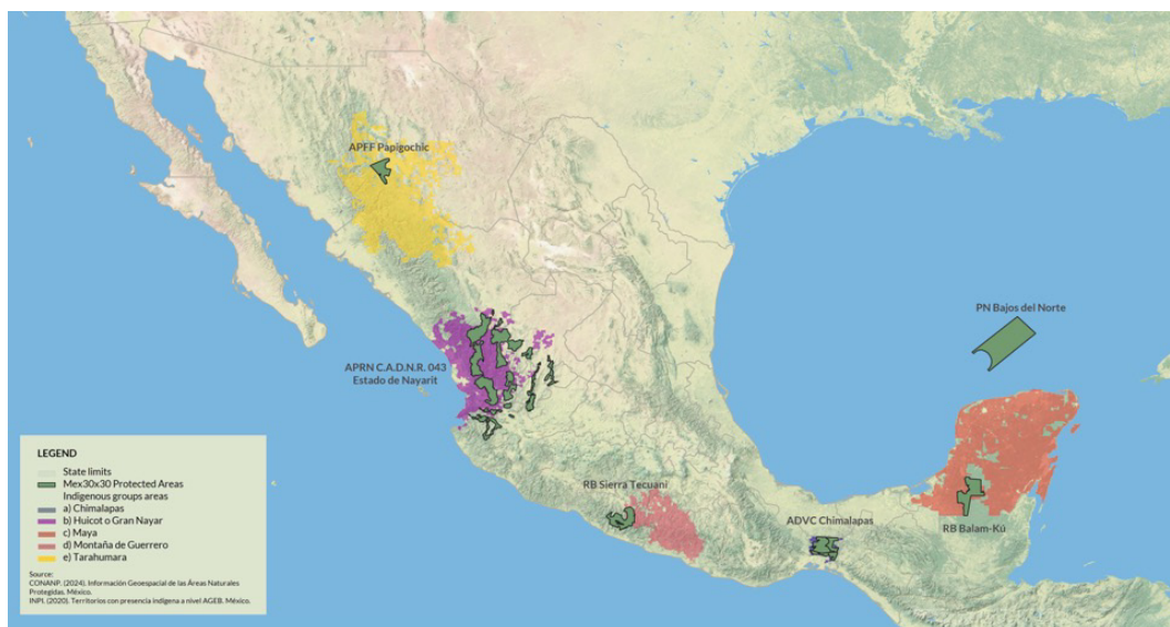
Map: MEx30x30 intervention areas.

The MEx30x30 project was approved by the GBFF Council on June 19th, 2024. Its implementation is expected to begin in 2025.